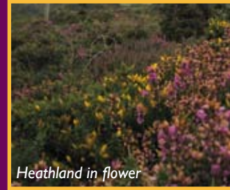
Heathland in flower

Grazing, scrub management and small scale controlled burning is vital to the health and rejuvenation of heathland. This management restricts the level of scrub invasion and creates a mosaic of ecological niches for plants and animals, ensuring the heathlands remain rich in wildlife.