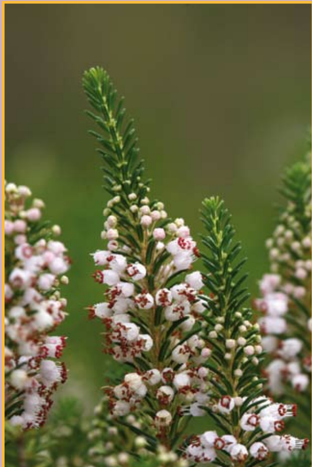
Cornish heath, a Lizard speciality