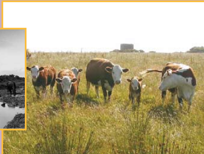
This wartime water tower is sometimes used as a roost for barn owls.

The heathlands and associated pools are the most important habitats on the reserve due to their international designation as part of the Lizard Special Area of Conservation.