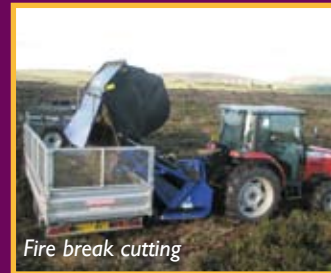
Fire break cutting