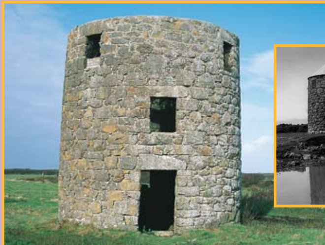
The windmill is a scheduled ancient monument (centre) pictured in 1938.