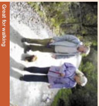
Great for walking