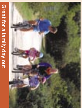
Great for a family day out