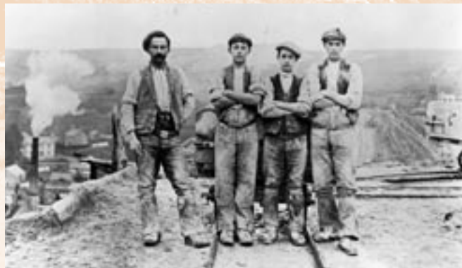
Clay workers in 1905

This leaflet is a guide to the Trails, which are all clearly sign-posted. So plan your day and enjoy your time in this fantastic part of Cornwall.