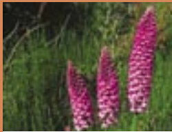
Southern Marsh Orchids