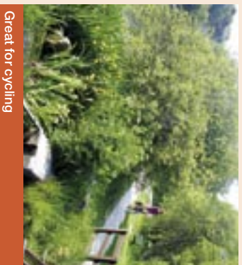
Great for cycling

Par Beach St Andrews Park and Local Nature Reserve